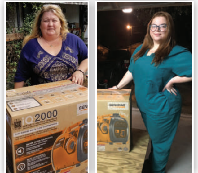
Congratulations to our 4 Grand Prize Winners at ACES!